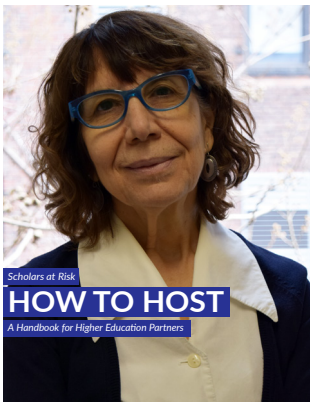
How to Host

These SAR publications and other activities can be found online at scholarsatrisk.org.