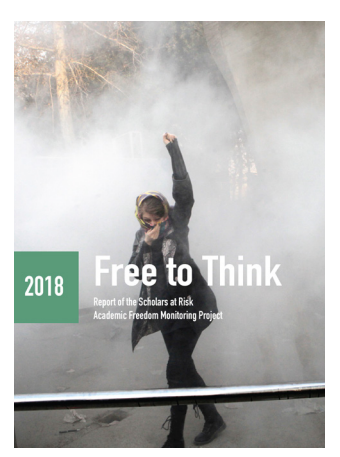
Free to Think 2018