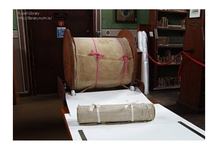
The Morpeth Roll