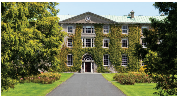
The Department of History, Maynooth University

Maynooth University's Department of History has European history – dating back to the early modern