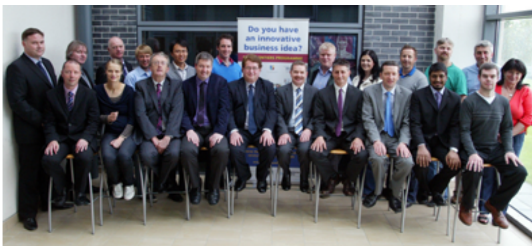
Photo below: 2012 New Frontiers Programme mentors and successful participants.

The Enterprise Ireland New Frontiers Programme provides wide ranging support for entrepreneurs in the early stages of business development and is being run by NUI Maynooth in conjunction with Athlone Institute of Technology (AIT). The programme provides mentoring, salary and incubation space for clients who have ideas with the potential to become high performance spin-outs (HPSU's). We are delighted to reach out to the community and provide critical early stage support and introduce the entrepreneurs to our network. The clients came through a competitive first stage to get into the final 14 and are based at AIT and NUI Maynooth. With a diverse range of business ideas (from pipe-laying to software) and backgrounds, they are a welcome addition to the campus and will have a positive impact on the university culture. The six month programme provides an accelerated learning environment to better position the entrepreneurs on their journey. If you have a project you would like considered for the programme please feel free to contact our office. http://commercialisation.nuim.ie/news-and-events/new-frontiers-programme