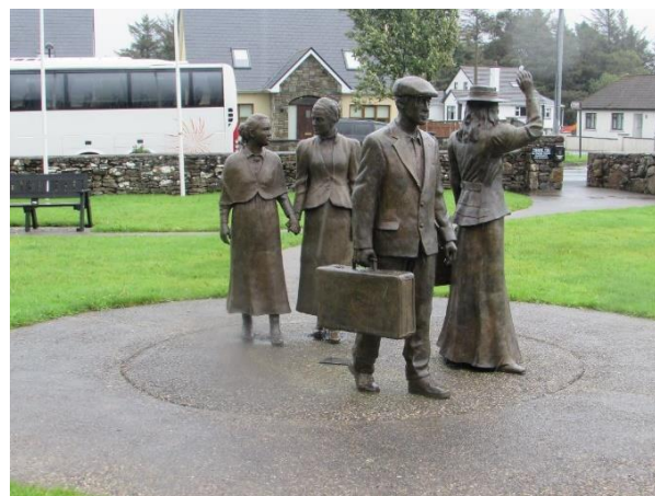
Lahardaun Memorial Park