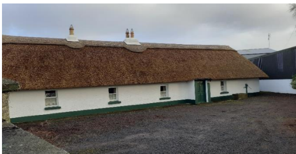
The Thatched House at Ballynagappagh, December 2020