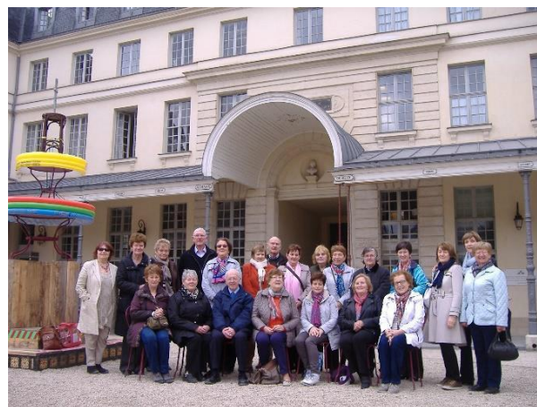
Retired staff at the Irish college in Paris, 2015