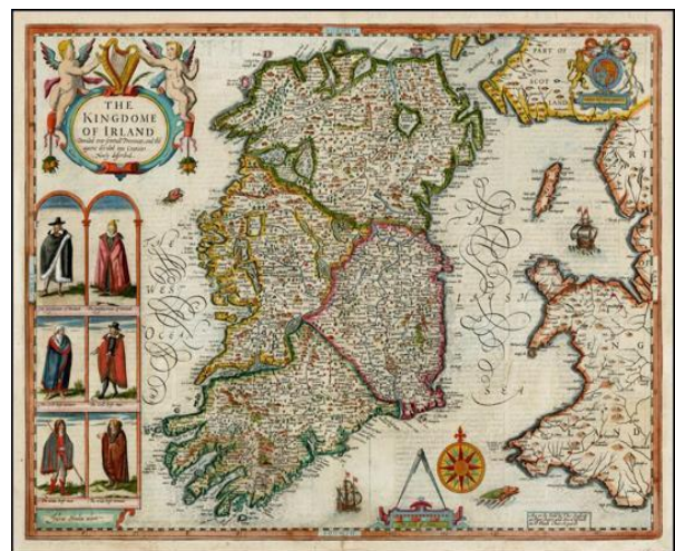
Map 3: The Kingdome of Irland by John Speed, 1610

The highly detailed Kingdome of Irland (Map 3) included considerably more information than on any previous map and was accompanied by separate maps for each of the four provinces that also included plans for the four main cities of Dublin, Cork, Limerick and Galway. In Ulster the long overdue revision of the depiction of the Fermanagh lakes was completed with the separation and reorientation of the upper and lower Erne lakes. The inclusion of The Kingdome of Irland in an increasing number of atlases that were targeted to international libraries, rulers and scholars ensured that a standardised visual representation of the island was promoted and widely accepted.