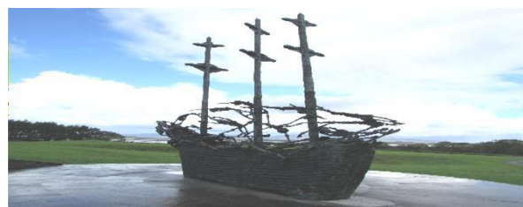
Famine Ship Memorial