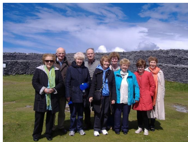
Retired staff at Inis Mór, 2013