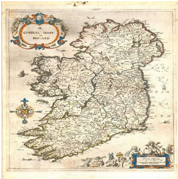
Map 4: General Map of Ireland by William Petty 1663

latter pair of course represent the majority of the population. The 'Wild' Irish man carries a spear as a reminder that everybody has not been assimilated into the new regime, in contrast to his 'Civil' counterpart who appears to be extending a hand of friendship to the new rulers from the empire of Britain while the 'gentleman' and woman convey a sense of relief that a new order has been established. The forlorn and haggard portrayals of the 'wild' men and women who appear to be emotionally connected stands in stark contrast to the elegantly attired and confident members of the 'gentle' class who, nevertheless, suggest a chasm between the squire and his lady.