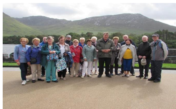
Kylemore Abbey Grounds

We devoted our fourth day to Kylemore Abbey which was originally built by Mitchell Henry as a gift to his wife. They fell in love with the area when visiting Kylemore on their honeymoon in 1850, returned in 1860 and built their dream home. It is now the home of the Nuns of the Benedictine Order. Some of us were fortunate enough to visit the small church on the grounds where a beautiful musical recital was taking place, performed by transition year students, it was something not to be missed.