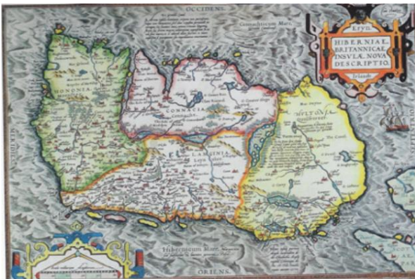
Map 2: Eryn map by Abraham Ortelius, 1573

the Western world's major modern atlases Theatrum Orbis Terrarum in which Ireland was given a full page and its cultural distinctiveness from the neighbouring island was reflected in a new title that included the Gaelic word 'Eryn' and also the Flemish word Irlandt (Map 2). The Atlas was a commercial success with up to 6,000 copies printed, many of which were likely to have been acquired for the libraries and offices of the most influential statesmen and scholars of England and elsewhere in Europe. The significance of these maps was summed up by Professor Willie Smyth (Head of Maynooth Geography department in 1974–77) in his 2006 conclusion that 'the normalization and standardisation of Ireland's image on British, European and world maps had begun'.